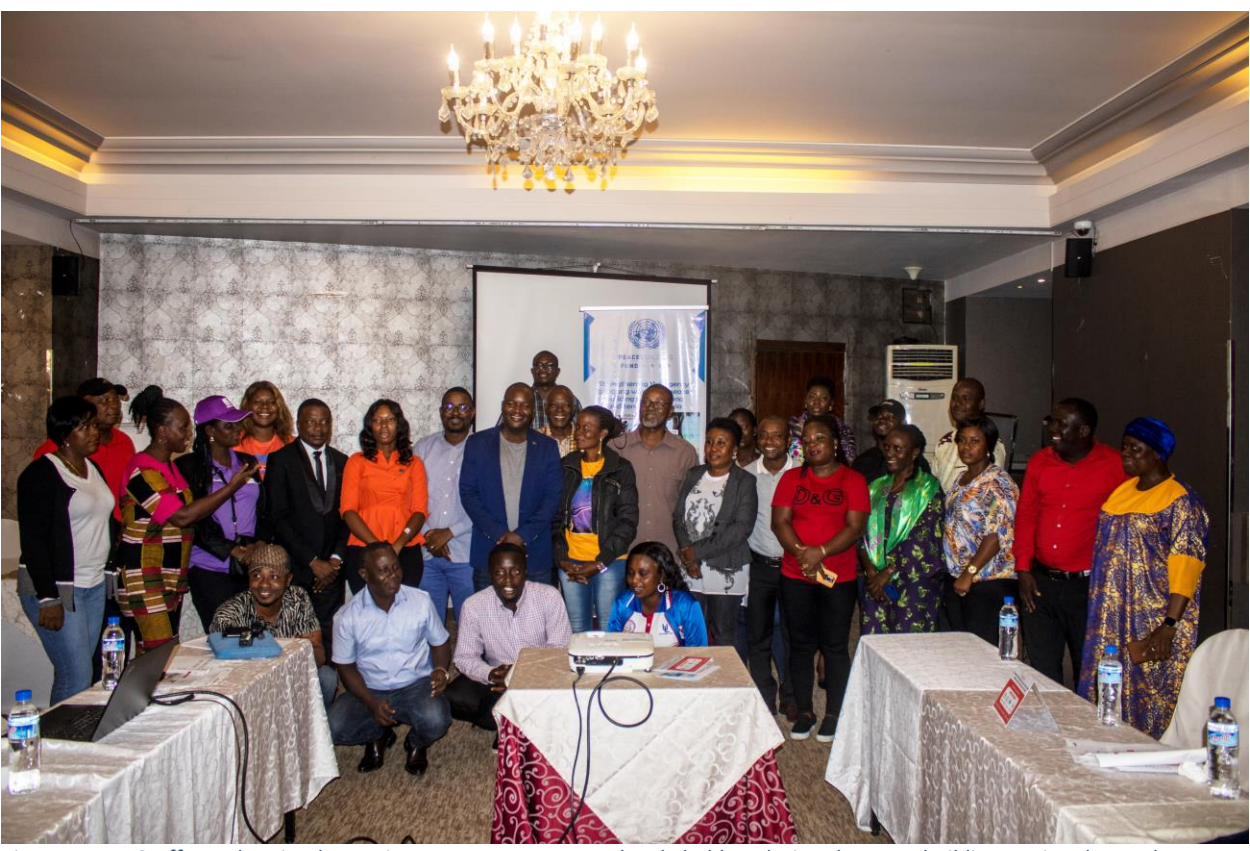
Figure 1: AAL Staff member, implementing partners, UNBPF and stakeholders during the Peacebuilding National Launch

Targeting 3,530 Beneficiaries with over 20,000 indirect Beneficiaries In four counties.