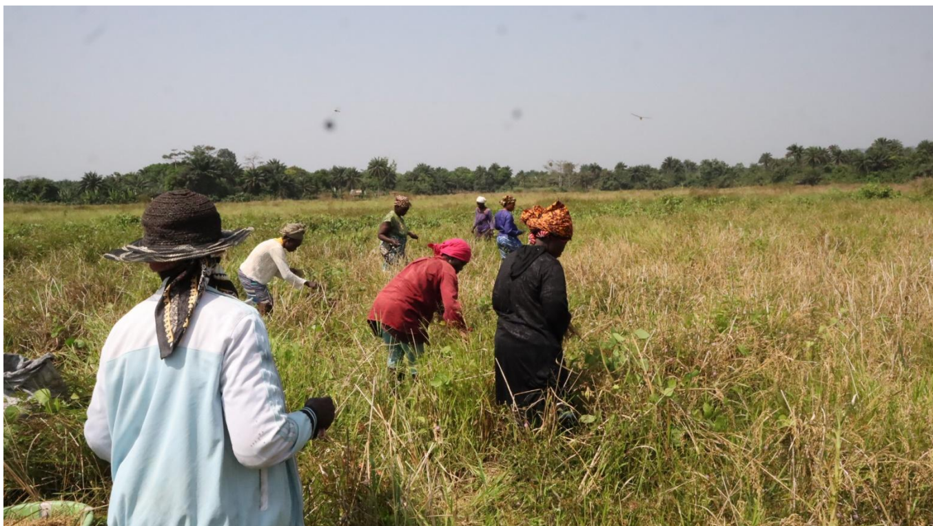
Above: The Zeleka Women are harvesting rice on their 38 hectares of land, which will soon be taken over by KONGO mining in Bomi County

Liberia Country and Climate Development Report (2020) revealed that climate change could shrink the Liberian economy by 15 percent and push 1.3 million people into poverty by 2050, while highlighting that the impact of implementing just few adaptation interventions could boost agriculture productivity and enhance climate resilience of almost 800,000 people. Hence, the need for climate actions to respond to essential infrastructure needs, human development promotion, sustainable land management, and climate risk and readiness has been identified as a high priority. Inadequate access to finance remains a key barrier to meeting Liberia's climate and development goals (World Bank, 2024). Zeleka Farm and Kongo Mining Case Study