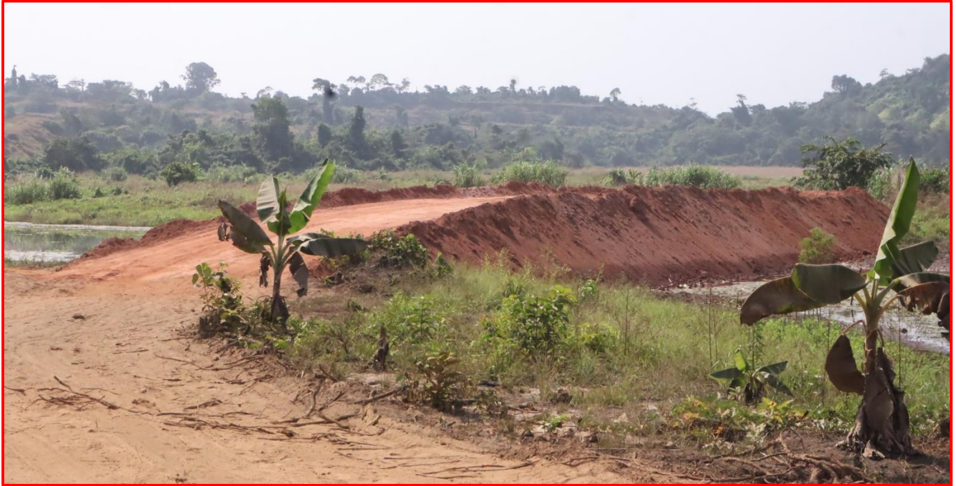
Above: Kongo mining company destroyed Coco and Plantein farms to divert the Bandu River for mining.

need to enhance climate proof agro-infrastructure systems through capacity enhancement of extension officers in climate smart farming and livestock raising technology.