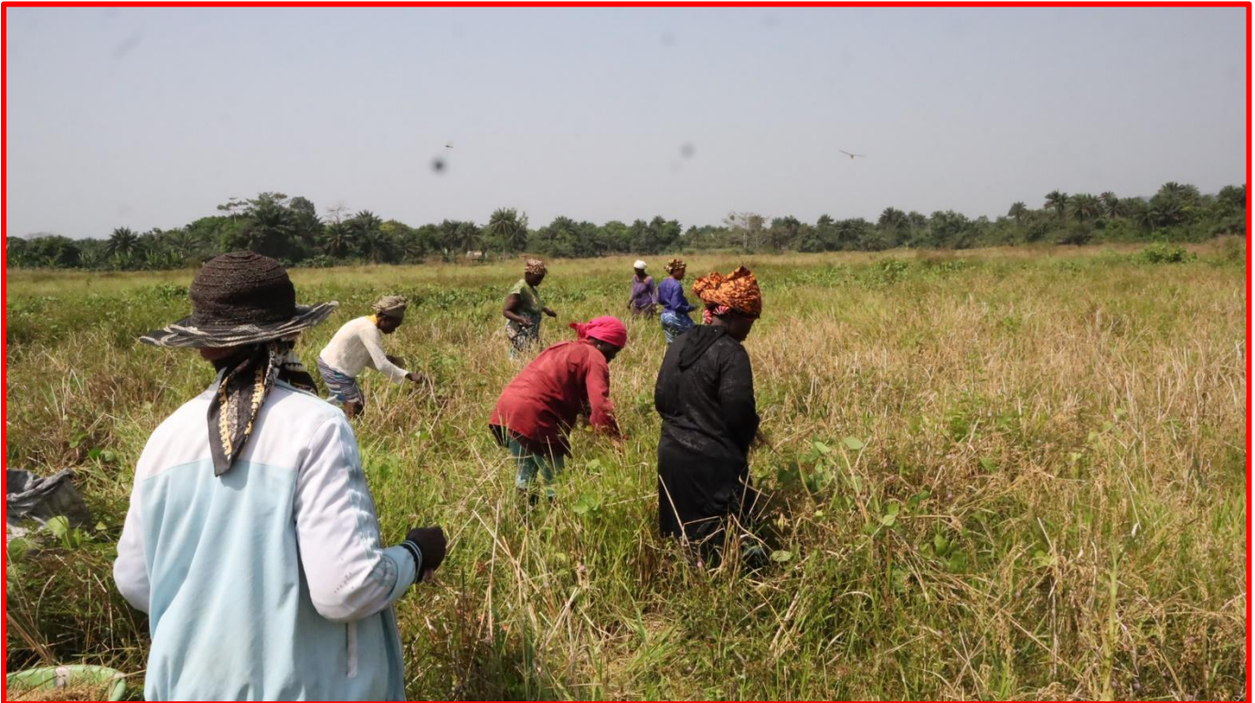
Above: The Zeleka Women are harvesting rice on their 38 hectares of land, which will soon be taken over by KONGO mining in Bomi County

Liberia Country and Climate Development Report (2020) revealed that climate change could shrink the Liberian economy by 15 percent and push 1.3 million people into poverty by 2050, while highlighting that the impact of implementing just few adaptation interventions could boost agriculture productivity and enhance climate resilience of almost 800,000 people. Hence, the need for climate actions to respond to essential infrastructure needs, human development promotion, sustainable land management, and climate risk and readiness has been identified as a high priority. Inadequate access to finance remains a key barrier to meeting Liberia's climate and development goals (World Bank, 2024). MINING CASE STUDY ANALYSIS AND REPORT | ActionAid Liberia