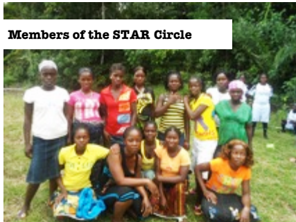
Members of the STAR Circle

Following the meeting the town gathered to kick some ball, both football and kickball matches were played. Gbogeasay