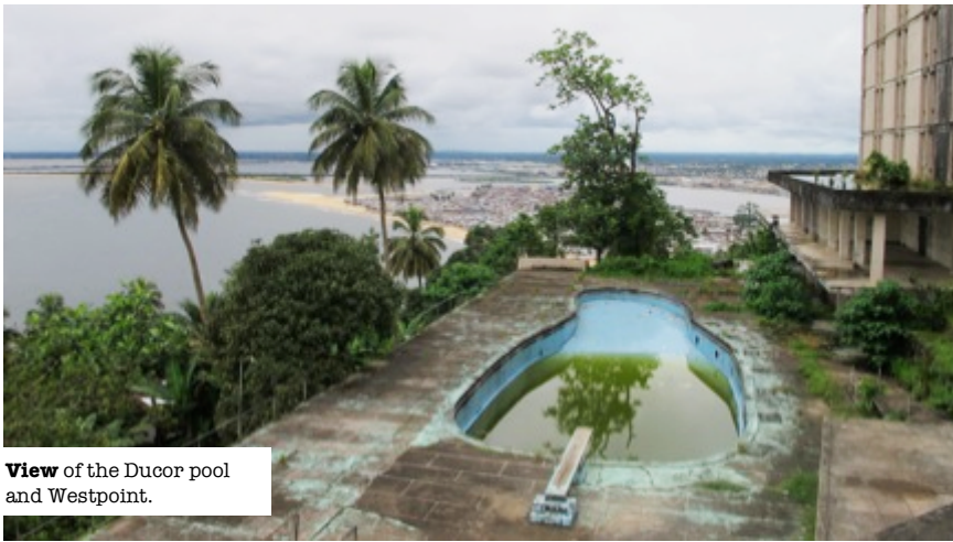
View of the Ducor pool and Westpoint.

I am glad to have been part of the Varney Town project. Varney is a rural community and there was no school there before. With AAL presence and with help from VIDA, the children of Varney Town have now gotten a school to better their future for tomorrow.