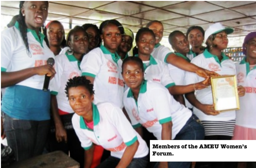
Members of the AMEU Women's Forum.