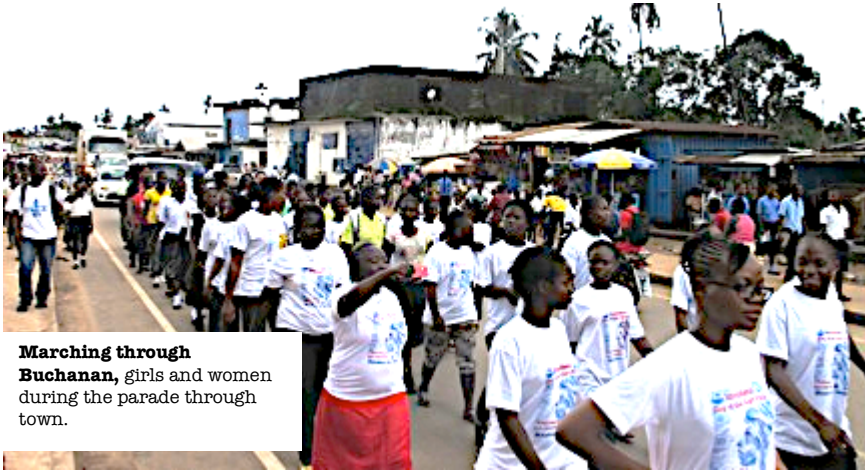
Marching through Buchanan, girls and women during the parade through town.