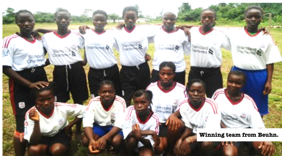
Winning team from Beuhn.

AAL are currently working with 50 women between the ages of 18-35 in Gbogeasay. They are involved in STAR circles, which is the ActionAid program of and "Societies Tackling AIDS through Rights". The women involved in the program expressed that they were very happy to be able to organize the meeting and support each other and the community. They were excited of the possibility to go back to school through the Adult Literacy Program in town and were convinced that keeping their girls and children in school is the right way to go. Some of the community members expressed a concern that so many children had dropped out, but also acknowledged that it is never too late to go back.