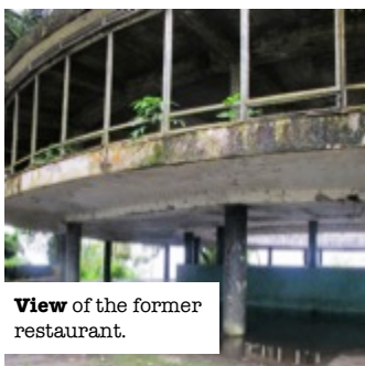
View of the former restaurant.

While walking around the hotel one can still imagine how it used to be. The history is captured in the walls but the sadness comes when thinking of what it still could be if the wars had not come. Today, the Ducor Hotel is an appreciated place among local and international photographers and film-makers as it offers a unique and picturesque setting with beautiful 360 degree views over Monrovia.