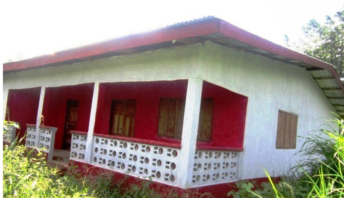
The four bedroomed Safe home constructed by Actionaid in Zwedru, Grand Gedeh County

In his parting words he called to AAL to extend in other parts of the county as there are other women who need the support. The communities were thankful for the changes that were brought through this project and they still feel that the continuation of these interventions will promote more change and that women will have more space in the society.