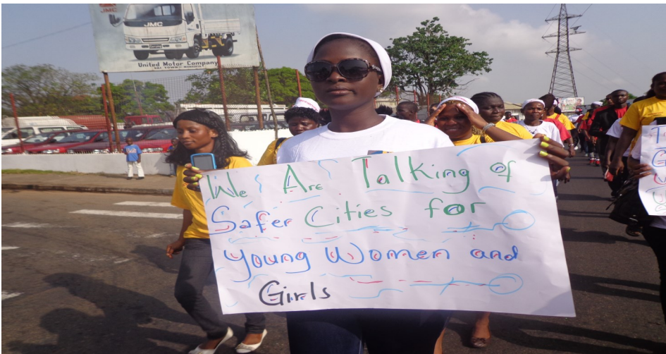
A section of university students during a Safe Cities Campaign for Women and Girls

A ctionAid Liberia is playing a strategic role on the Safe Cities Campaign with a focus on developing/strengthening of systems and structures for the protection and safety of female university students. Over the years, we have contributed towards building Safe Cities programme within ActionAid by participating in the pilot and scale-up activities. Key activities undertaken then included: Safety Audit, partnership development, trainings workshops for staff and awareness raising through consultative forums, parade, and launched of Women and City report I.