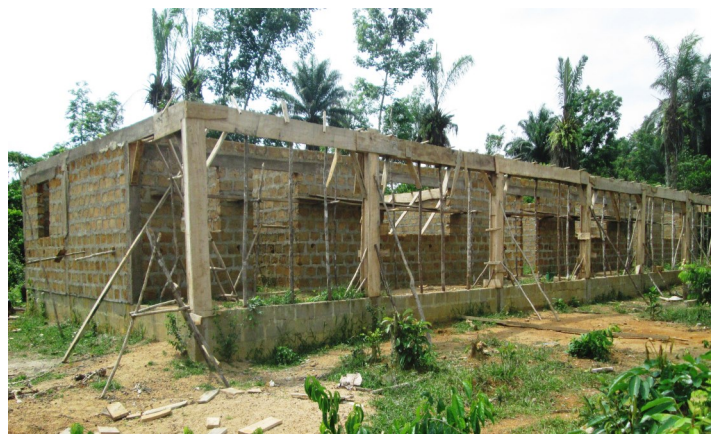
Varney Town School under construction