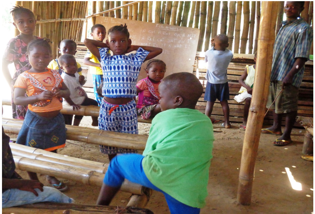
A photo of the children in the classroom along with one of the volunteer teachers (far right)