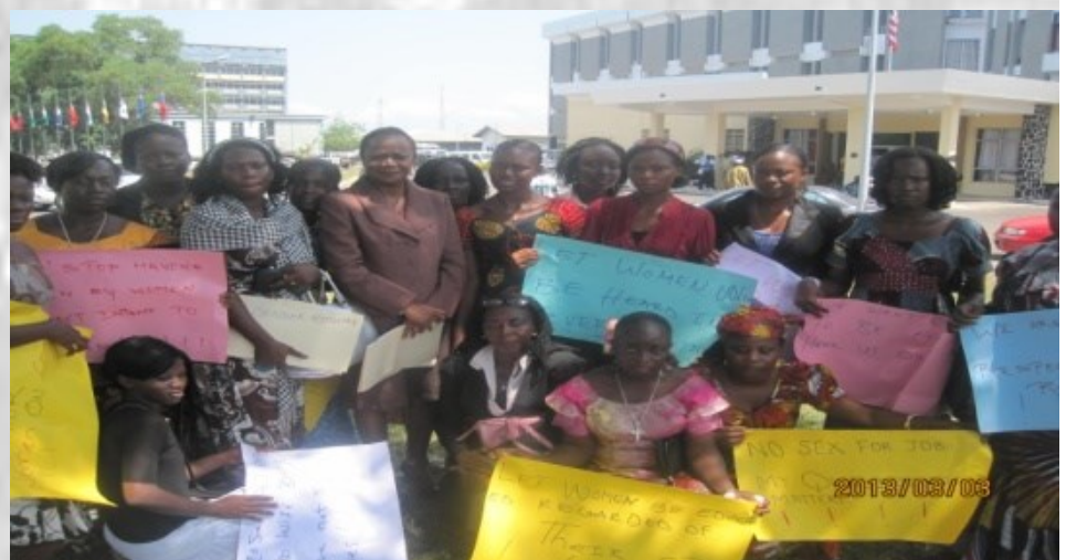
University students pose for a photograph with Chairperson of Women Legislative Caucus

To broaden the scope of the campaign focus that will satisfy issues relating to violence against women and girls accessing public services, a national level policy scoping will be done and the program design planning workshop was held during the month of May to identify key activities to support the safe cities campaign.