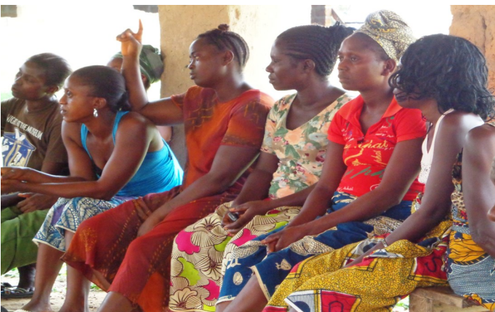
A section of Women in Zleh Town, Grand Gedeh, speak out during the Internal Evaluation of the Access to Justice for Women Project

Cases of rape, wife beating and forced marriage were very high and the women did not know what to do or how to go about it, but the project brought a change to this. The STAR CIRCLE, Girls Forum and the Agriculture components created the most impact. The STAR CIRCLE created a forum where women could meet, discuss issues that affect them