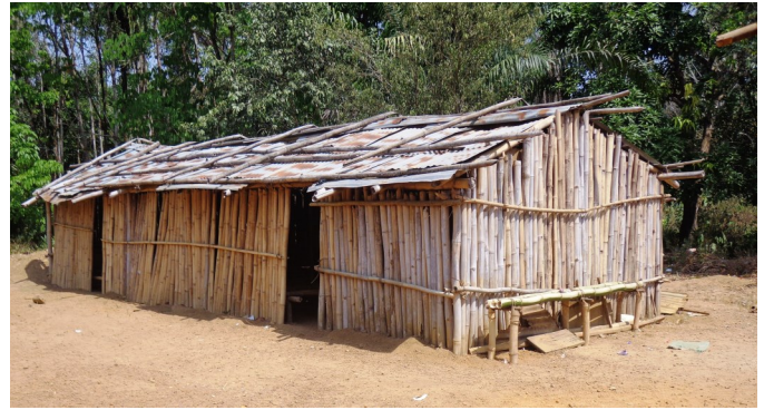
The current structure of the school

The school is awaiting completion and it is expected that the school will serve 10 villages, Varney Town and surrounding and 93 students from first to sixth grade. Work will be in progress by community partners to get local and government support for the new school, which includes better and qualified teachers and an operation and maintenance budget.