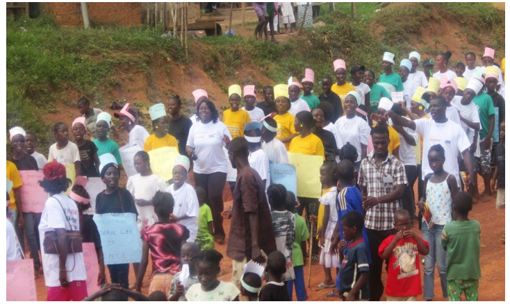
The community participating in one of the activities in the region

and try to suggest solutions. It created 'space' for reporting Violence cases and finding out ways to address them. Through this, the women have gained confidence and are able to speak without fear. 'Before this project came, I was not able to speak in public but through the STAR CIRCLE, I can stand before people, speak to them and even facilitate sessions on Violence Against Women.' These were sentiments from one of the women in Zleh Town.